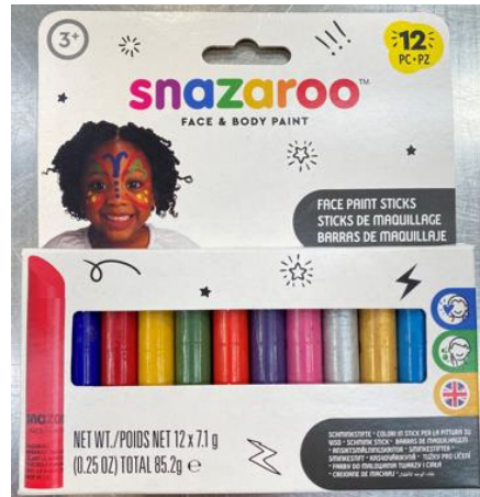
Object of the declaration.