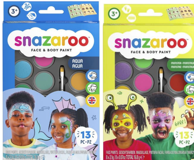
Objects of the declaration / Objet de la déclaration