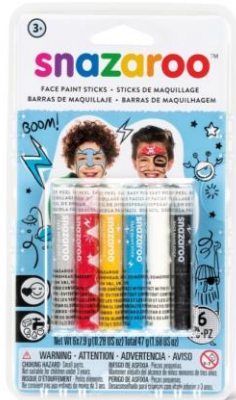
Object of the declaration.