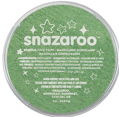
Object of the declaration (example from range).