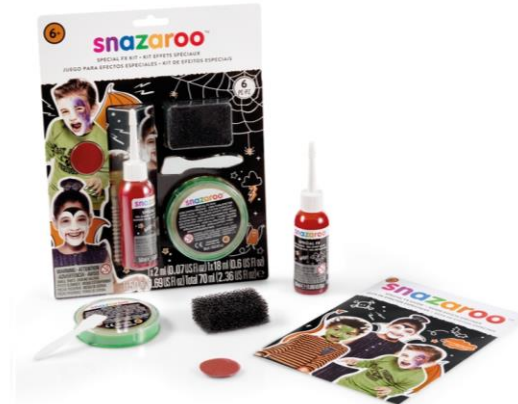
Object of declaration